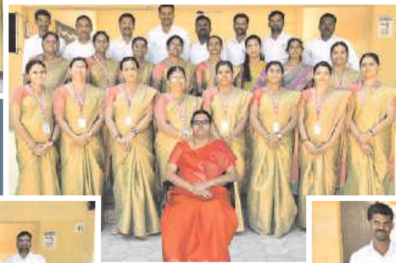
High School Teachers