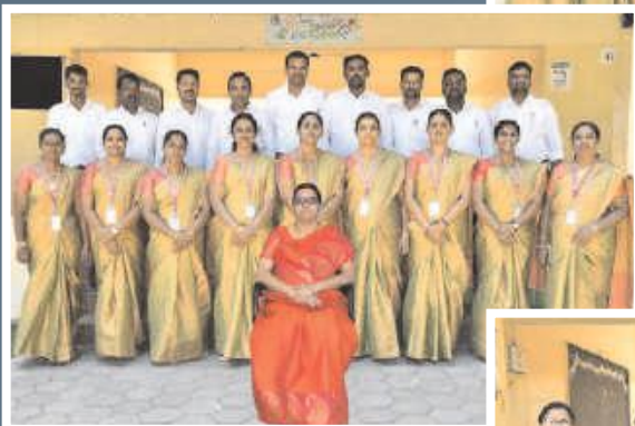
Hr. Sec. School Teachers